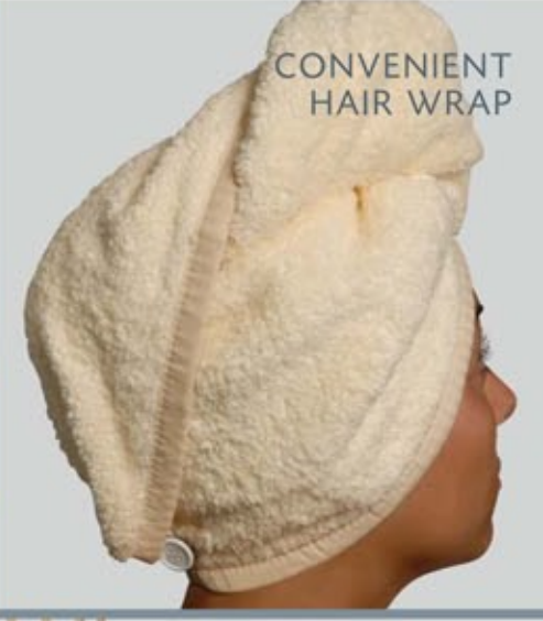
CONVENIENT HAIR WRAP