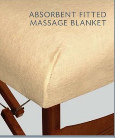
ABSORBENT FITTED MASSAGE BLANKET

Available in White and Linen Flat Sheets, Fitted Sheets, Pillowcases, Optional Embroidered Shams, Duvet Covers, Bedskirts and Throw Pillows