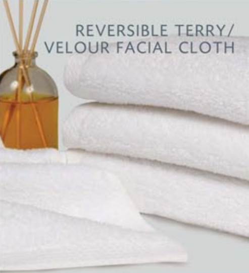
REVERSIBLE TERRY/VELOUR FACIAL CLOTH