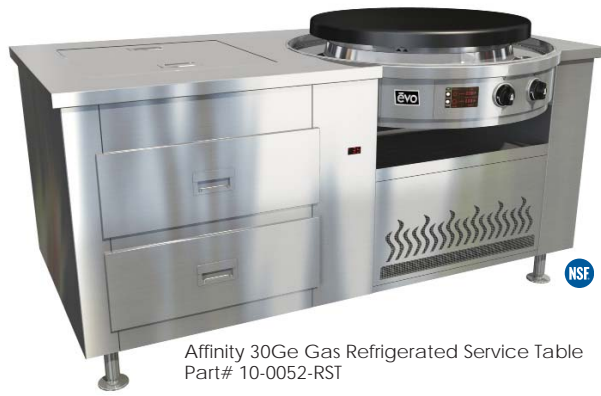
Affinity 30Ge Gas Refrigerated Service Table Part# 10-0052-RST