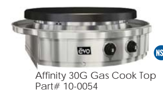
Affinity 30G Gas Cook Top Part# 10-0054