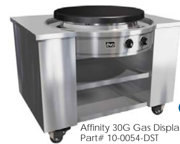
Affinity 30G Gas Display Service Table Part# 10-0054-DST