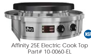
Affinity 25E Electric Cook Top Part# 10-0060-EL