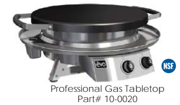
Professional Gas Tabletop Part# 10-0020