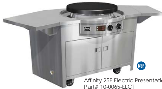
Affinity 25E Electric Presentation Cart Part# 10-0065-ELCT