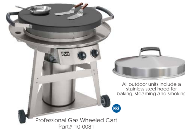
Professional Gas Wheeled Cart Part# 10-0081

All outdoor units include a stainless steel hood for baking, steaming and smoking