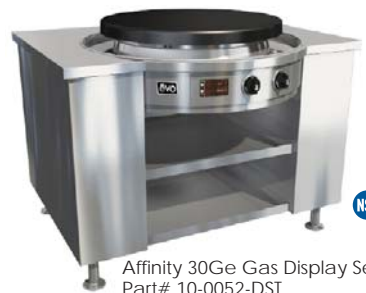
Affinity 30Ge Gas Display Service Table Part# 10-0052-DST