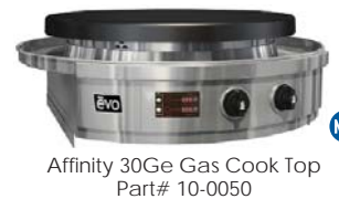
Affinity 30Ge Gas Cook Top Part# 10-0050