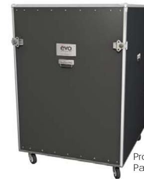
Professional Transport Case Part# 11-0010-CC

All outdoor units include a stainless steel hood for baking, steaming and smoking